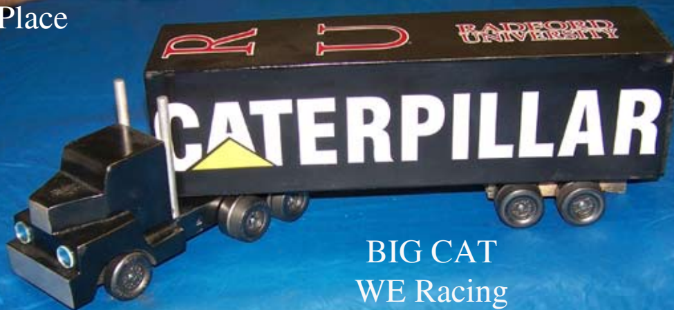
BIG CAT WE Racing