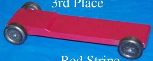
Red Stripe WE Racing