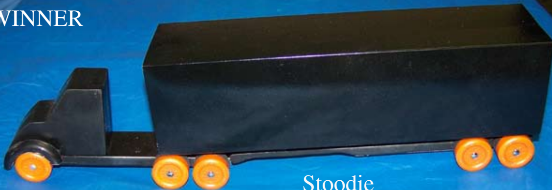
Stoodie Blind Mule Racing