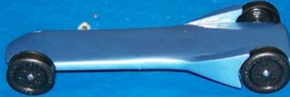
Blue Devil Blind Mule Racing