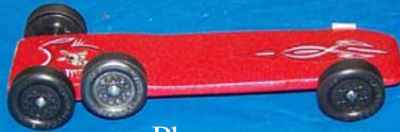
Phenom Blind Mule Racing