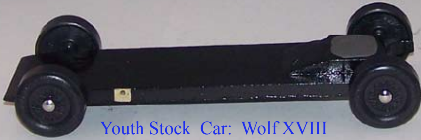
Youth Stock Car: Wolf XVIII Driver: Sidney Allen