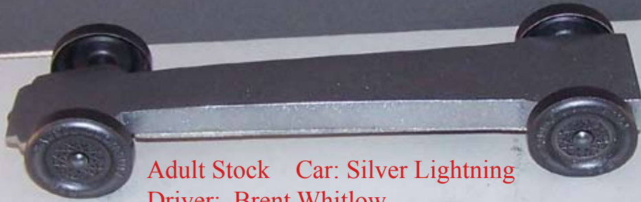
Adult Stock Car: Silver Lightning Driver: Brent Whitlow