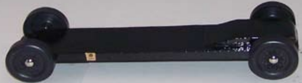
Adult Stock Car: Wolf XXXI Driver: Sid Allen