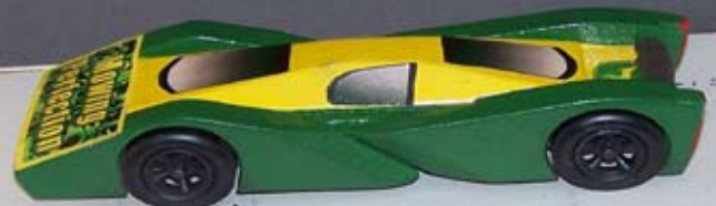
Master's Club Car: Mowing Perfection Driver: Jordan Whitlow