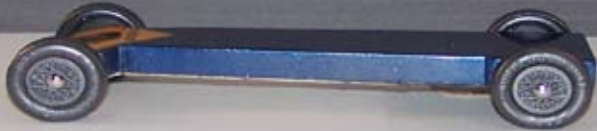
Adult Stock Car: Opossum Xing Driver: James Whitlow