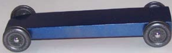
Ltd. Modified Car: Blue Lightning Driver: WE Racing