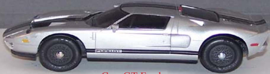
Car: GT Ford Driver: MIR Racing