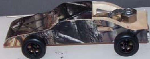
Master's Club Car: Hunter Driver: Brycen Cockram