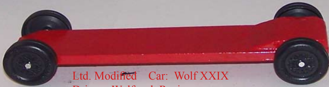
Ltd. Modified Car: Wolf XXIX Driver: Wolfpack Racing