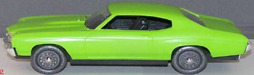
Car: Lime-Aid Driver: WE Racing