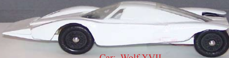
Car: Wolf XVII Driver: Wolfpack Racing