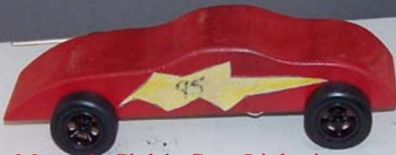
Master's Club Car: Lightning Driver: Dustin Cockram