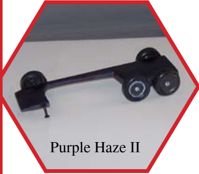
Purple Haze II